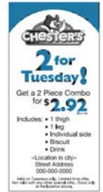
Example of a 2 for Tuesday newspaper ad template

To target customers who read the local newspapers, place an ad announcing a special offer or featured product in your deli. How it works: Request the Chester's Newspaper Ad template from Hays Food Systems. Contact your local newspaper that serves the neighborhood around