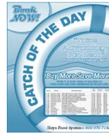
Our “Catch of the Day” products and price list.