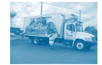
Our Chester's truck and chicken suit at a Customer Appreciation Day.

Nov. LSM Promo Kit -$68.90 (Includes 1 poster, 200 bag stuffers, 100 door hangers) Dec. LSM Promo Kit -N/A Items must be purchased individually—posters, catering labels, bag stuffers, & door hangers are available.