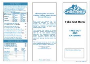
The front side of the "brochure-style" carry-out menu.