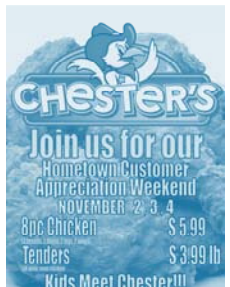
This design was used for a custom banner and a poster for a Customer Appreciation Day.