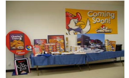
Available marketing materials displayed in our showroom

We hope you find the information in this newsletter very useful. If you have any feedback or would like to suggest topics for our next issue, please e-mail info@haysfood.com