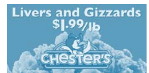
This design was used for a custom banner that is displayed on a regular basis to promote a liver/gizzard special.

with your city hall for rules and regulations. Please allow 4-6 weeks to complete your banner. Call our office to discuss in detail.